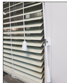
Cord + Tilt wand

To shade your space, turn the tilt wand LEFT or RIGHT to set the desired lighting.