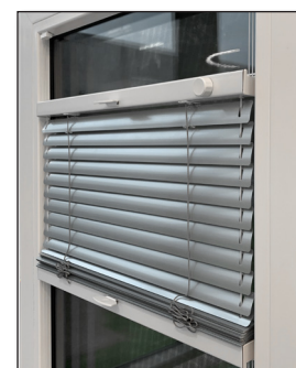
Handle on profile, knob

The internal Top-down blind is raised or lowered using the handle on the profile. Shading is adjusted by turning the rotary knob.